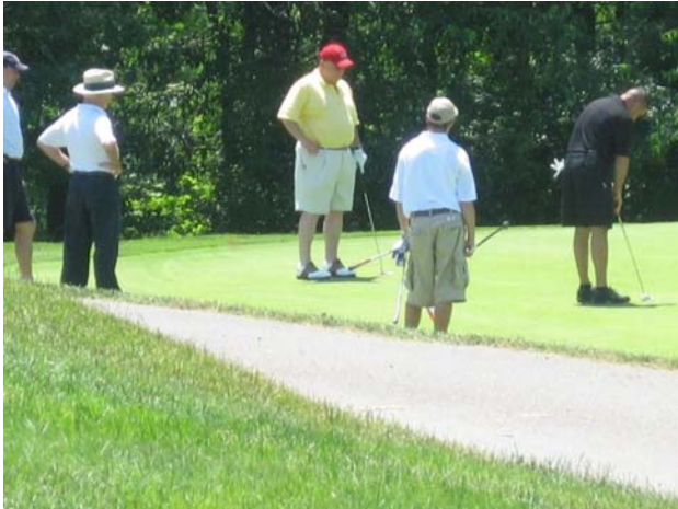
West View Savings Bank – One of the Proud Sponsors of HEARTH'S 15 th Annual Tee & Green Golf Event

H omelessness E nds with A dvocacy R esources T raining and H ousing