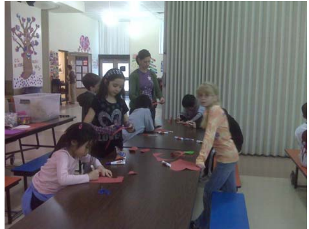
The Baierl Family YMCA Campaign for Strong Communities Supports Many Children's Activities.

In May 2006, 50 years after opening the North Hills YMCA branch, the YMCA moved into their new home on Nicholson Road in Franklin Park.